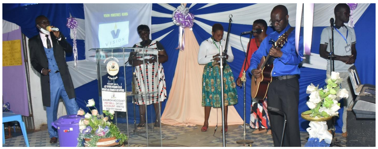
Worship team setting pace for the day

Eldoret is the youngest VMK chapter. This region was officially launched in 2020 November. We are happy to mention that it is as well one of the fastest growing chapter. In this years' conference alone, the number of ministries/ Churches represented was twenty three. This was one of the regions where we witnessed great consistency in the attendance.