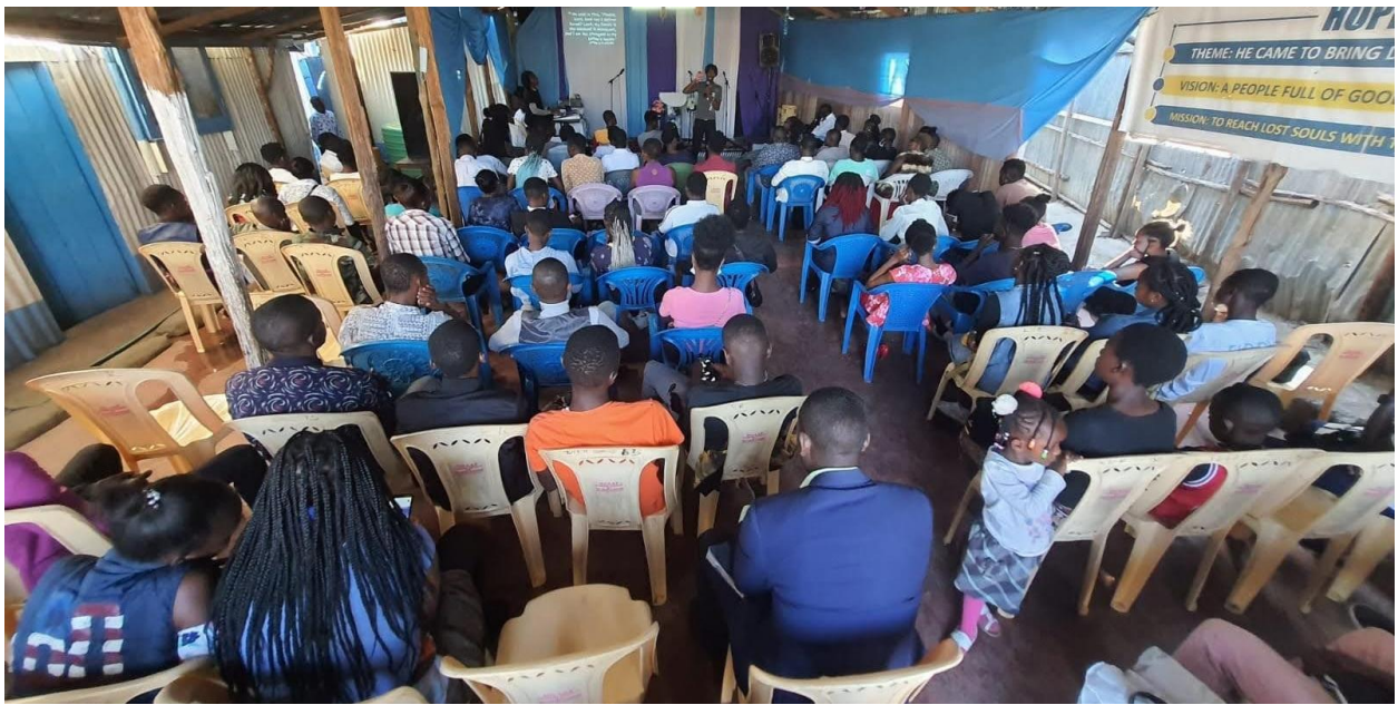
Youth Rally at Hope Bible Chapel

VMK youth wing held a great youth seminar on 2<sup>nd</sup>, January at Hope Bible Chapel, Nairobi. The meeting brought on board all VMK partnering churches.