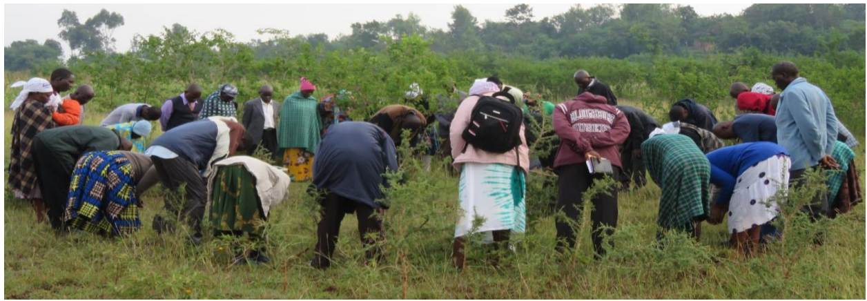
Brethren praying at the site where new church plant is to be built.

We encourage our partnering churches to go out and preach and after that they baptize and gather them in a church, discipling them. Nyanza was the first to surprise with a new church plant in January 23<sup>rd</sup>.