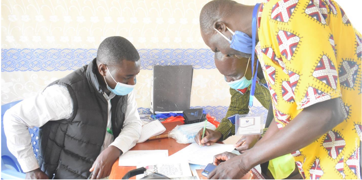
Registration at the registration desk on arrival

Nyanza was our third region to hold a conference this year. Nyanza conference was a little different from others. This is because most of the delegates boarded unlike other regions where all delegates were day scholars except for the speakers and the host team.