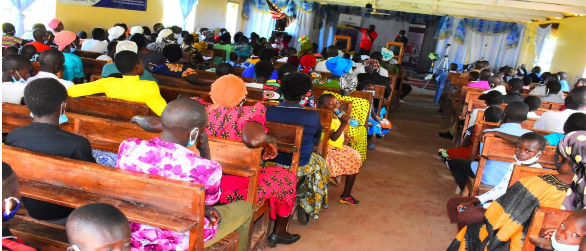
Conference delegates during the conference

'The gospel is good news for sinners because it promises freely to forgive all the sins of those who believe. As Paul states (Rom. 4:5), "But to the one who does not work, but believes in Him who justifies the ungodly, his faith is credited as righteousness. "Jesus illustrated the same truth in His parable of the Pharisee and tax collector.'