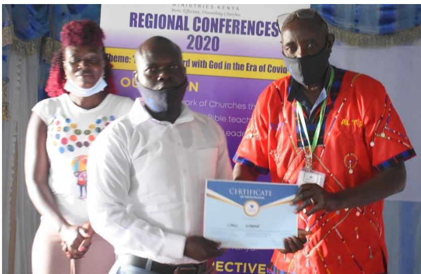
Certificates being presented to participants

this? ii. Most pastors don't give us time as their wives. They dominate so much. Please help them understand us... (a comment from a lady...)