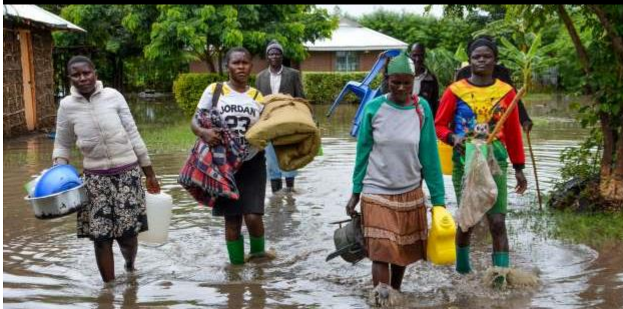
Nyora brethren relocate to a nearby school for safety.

Nyora chapel pastor's house destroyed by water. The chapel still flooded and church members forced to relocate from their homes.