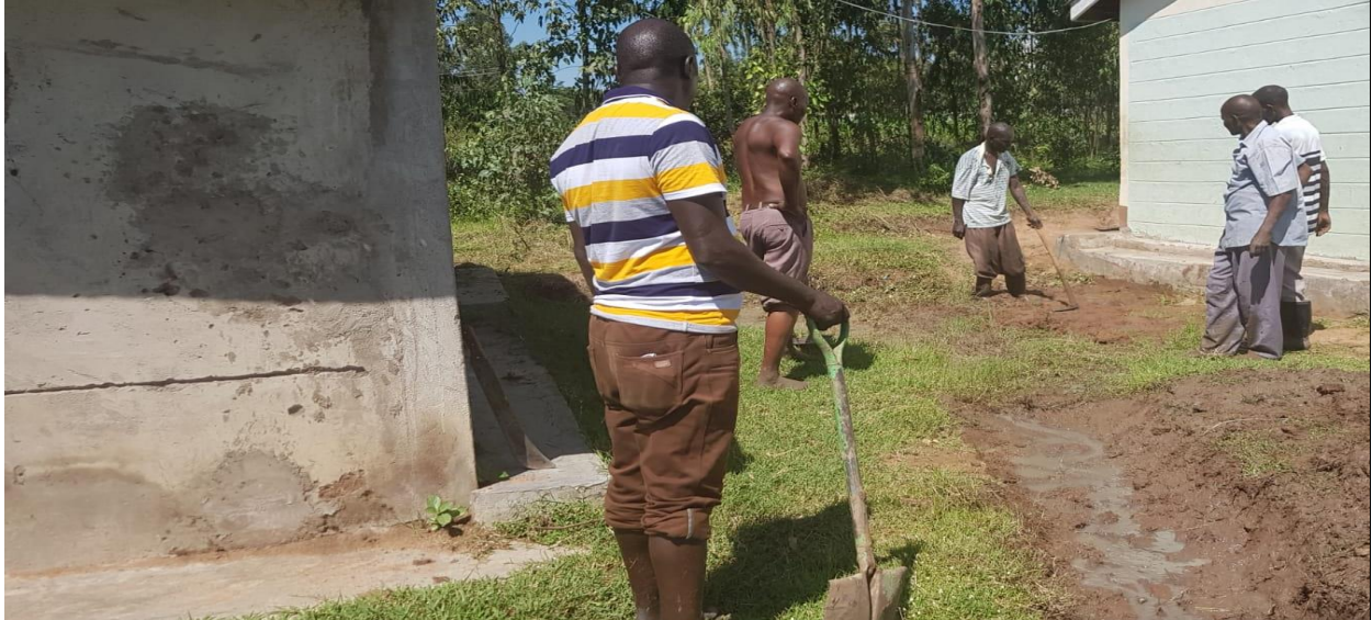
Grace Chapel elders meet to dig a trench to protect the church from flood.