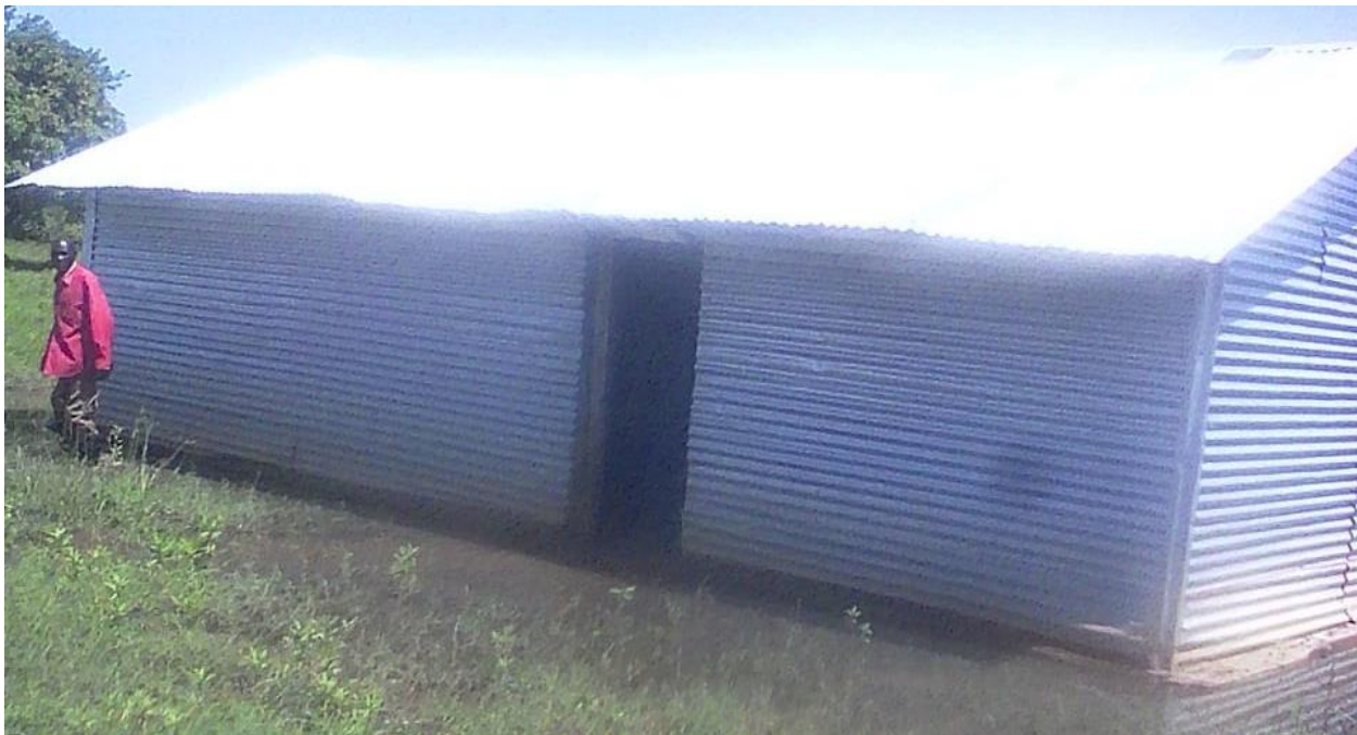
The flooded Nyora Chapel, Migori County

News reached us that the church at Nyora, Migori County had just flooded and most of our believers were victims. The church building was flooded and pastor's house had just been vandalized by the flood. Pastoral leaders were requested to stand in prayer on behalf of the members of Nyora Chapel