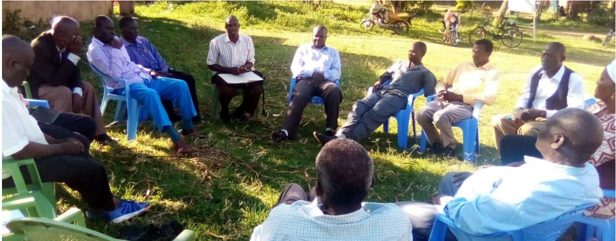
Western leaders october conference follow-ups meeting held in March.

This region was privileged during the month of March being that it had not reported any Covid-19 case. The pastors in this region carried on with their meetings as usual and could meet their congregation through door to door visit without any fear. The regional leaders had one follow-up meeting for October conference.