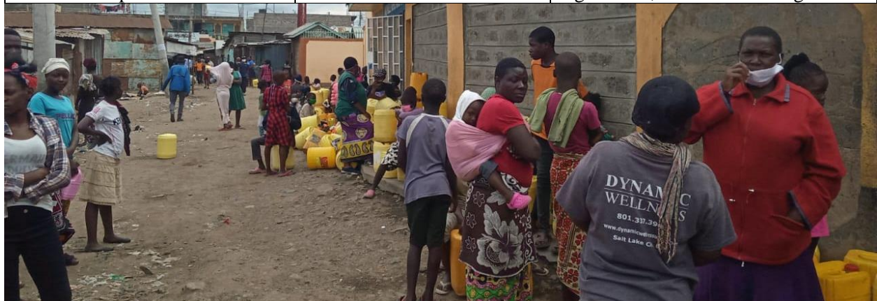
Outreach Community church offering water for free to the community for a week help them in sanitizing