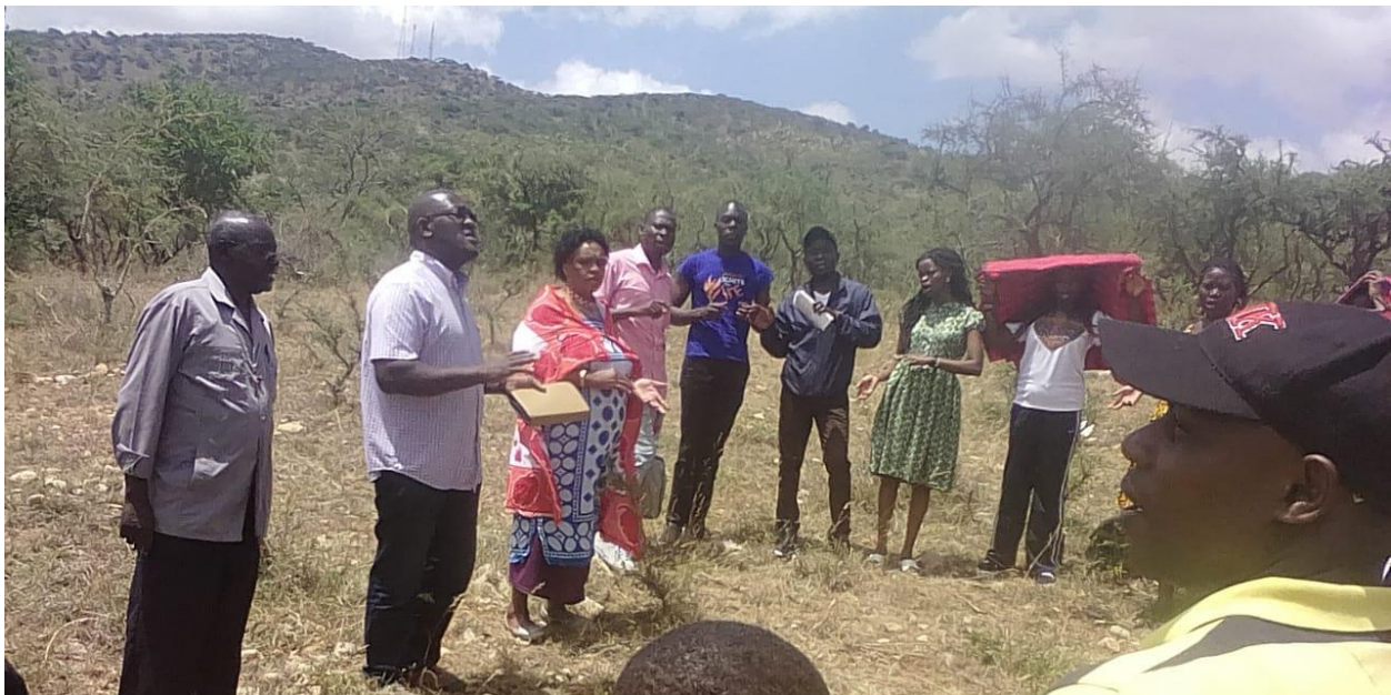
Kajiado leaders meeting for prayers on the mountain

At Alkesumet Prayer Mountain, the chairperson organized prayer meetings on 20 th and 28 th that was attended by members. In the meeting they were praying for all partners (local and international) for safety amidst the Corona-Virus pandemic. They as well had opportunity to discuss on how they would continue with fellowships during the pandemic in any case the government become serious in monitoring the public gathering suspension rule. In their meeting they resolved to use door to door means to reach the believers. They as well resolved to be using the phone calls to hear from pastors whenever possible